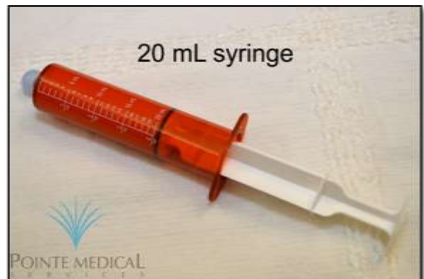
Figures 1 & 6