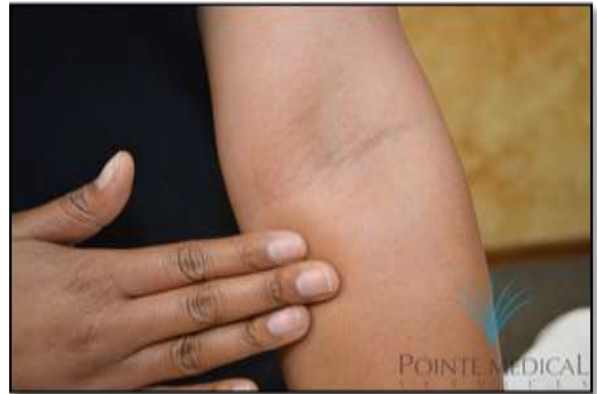
Figures 13 & 14