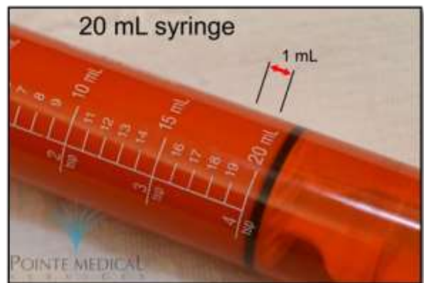
Figures 2 & 8