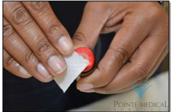
Figures 24 & 25