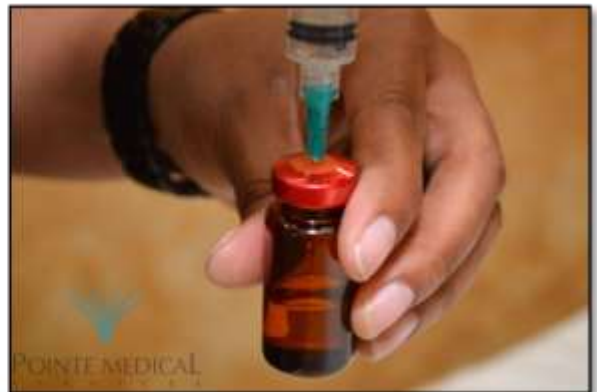
Figures 26 & 27